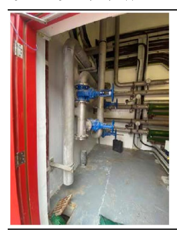
Figure.3 Misalignment of overflow pipeline to the drain pit inside the TE pump room